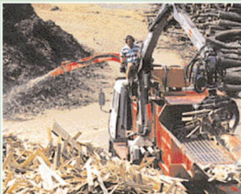
production of hacked chips

Place: Güssing/Bgld. altitude: 220m date of initial production: Oct 1996 customers: 260 objects length of network: 24 000m performance: 14kW boiler: 5 MW organic matter boiler 3 MW organic matter boiler 6 MW oil boiler for peak hour production delivery: 26 mio kWh/year investment costs: 10,17 mio EUR area supplied: Güssing town/Krotten dorf (town part)/Tobaj (village)/Industrial area North/Glasing (town part) staff: 1 plant manager 3 technicians 1 skilled worker 3 burean staff (bookkeeping) deliverers of fuel: Bgld. Forest Union Fa. Meyer(floor tile industry)